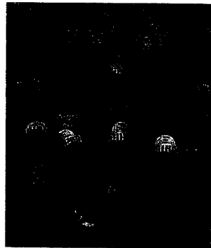
Kindergarten made Veteran's Day hats!