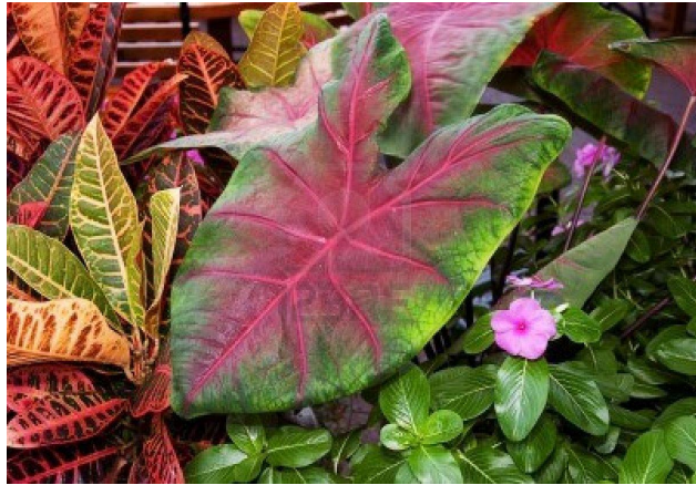
This photo shows bright colored foliage Caladium