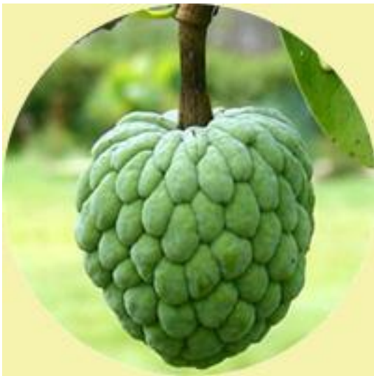
This is a sugar apple