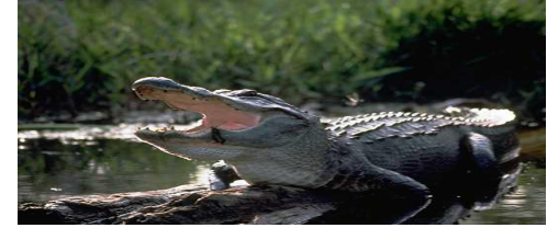
The American Alligator is one popular animal in this area.

There are many types of animals here. There are mammals, reptiles, and amphibians.