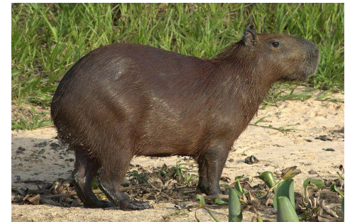
Brazil's Capybara is also a popular animal.