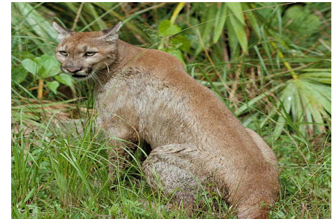
The Florida Panther is another popular animal.